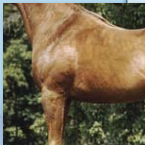
BINT OM EL SAAD EAO*361 Grey 1958