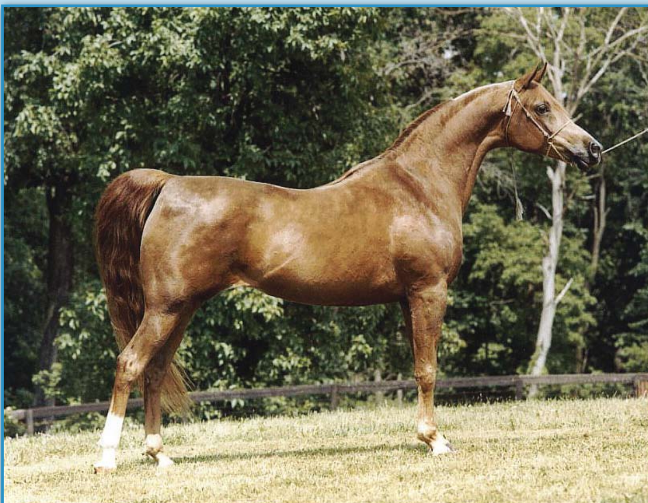
A mare of exceptional balance, *Serenity Sonbolah was the unanimous U.S. National Champion Mare in 1971, and the first Straight Egyptian to earn that title