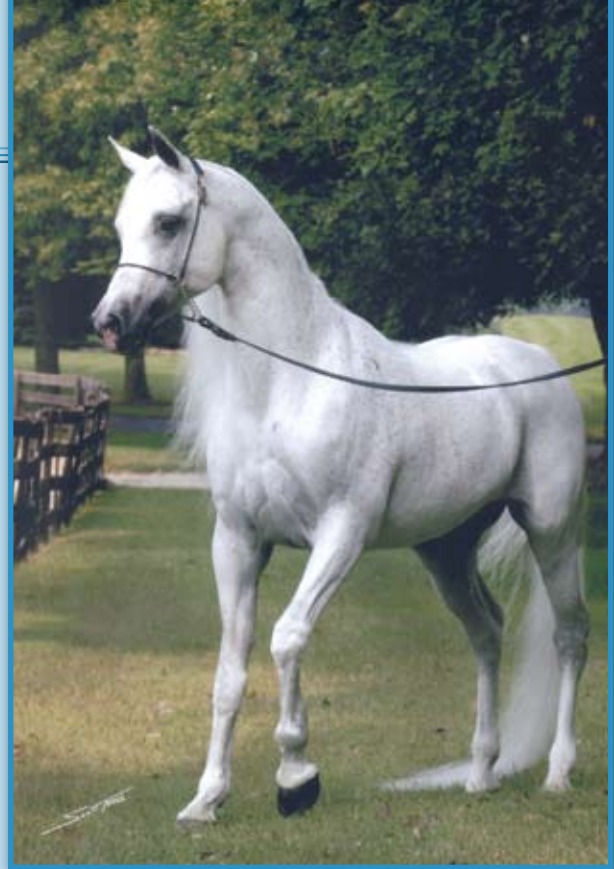
Imperial Al Kamar (El Hilal x Imperial Sonbesjul) represents the damline of *Serenity Sonbolah.

“She is one of those steeds of race that stretch themselves fully in their gallop, springing and light of foot, pressing on in her eagerness: her longing is the far-extended desert, plain giving unto plain”. □