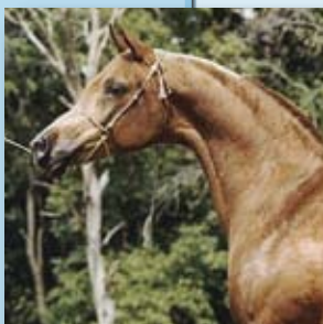
EL MOEZ IOHB*8 Grey 1934