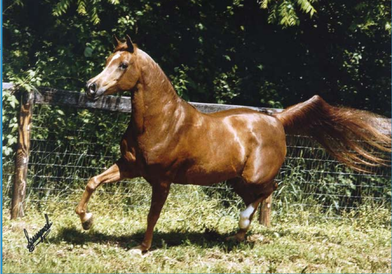
*Serenity Sonbolah exhibits her special style and grace