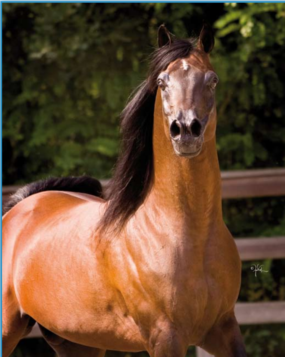
ZT Faa'iq, a former European Junior Champion and an outstanding young sire, traces in tail female to *Serenity Sonbolah. He is owned by Al Rashediah Stud (Kingdom of Bahrain)