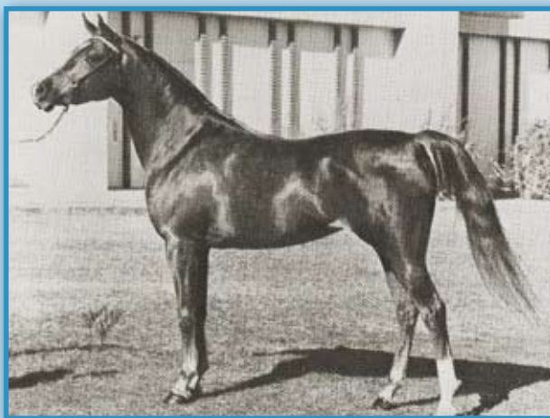
The young *Serenity Sonbolah (Sameh x Bint Om El Saad)