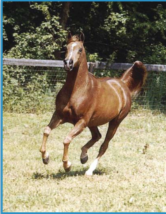
*Serenity Sonbolah at Imperial Egyptian Stud

Sonbolah was the second foal of Bint Om El Saad, a Nazeer daughter bred by the Royal Agricultural Society who also produced the well-known EAO sire, Ikhnatoun. Her sire, Sameh, was a grey stallion bred by the Inshass Stud. He was known for the smooth bodies and balance of his offspring, and Sonbolah was no exception. In tail female she represented the Kubailah Rodaniyah strain through the Bint Rissala branch tracing to Rodania, a family greatly prized by Sir Wilfrid and Lady Anne Blunt. They had purchased Rodania in the desert on April 12, 1882 from her owner, a member of the Anazeh tribe who had acquired her from the Ruwala Bedouin. It is likely that