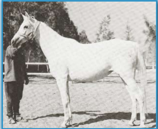
Bint Om El Saad, foaled in 1958, was the dam of *Serenity Sonbolah and full sister to Rafica. She also produced the well-known EAO stallion Ikhnatoun by *Farazdac